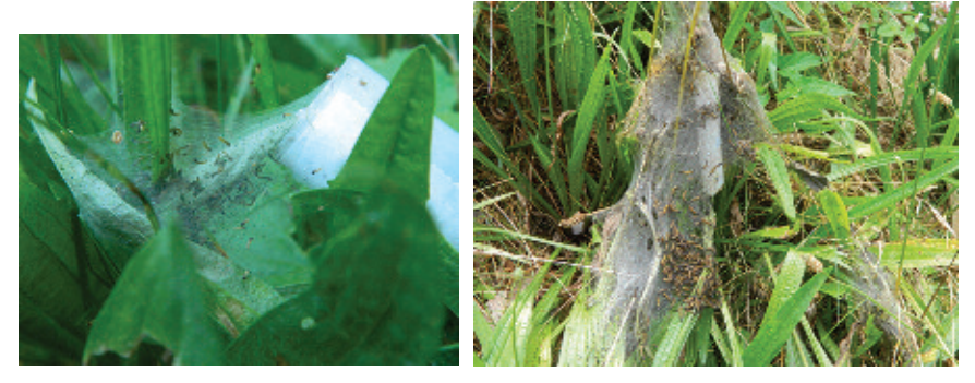
Fig. 5 Fig. 6