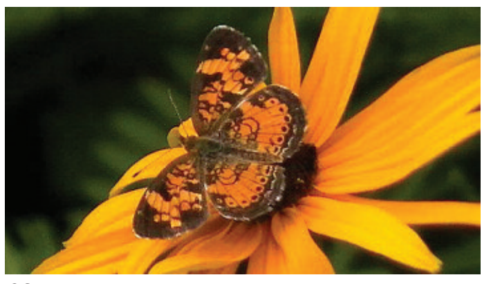
Pearl Crescent ( Phyciodes tharos), 7/27/15, Plymouth, MA, David Newman