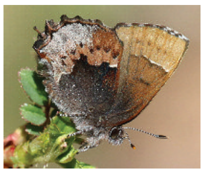
Henry's Elfin ( Callophrys henrici), 5/3/15, Milton, MA