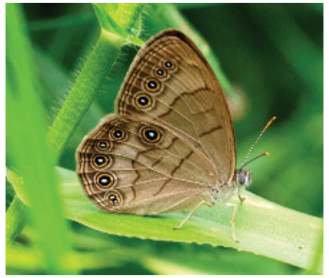
Appalachian Brown ( Satyrodes appalachia), 8/9/15, Canton, MA

Long Dash ( Polites mystic), 7/7/15, Lenox, MA