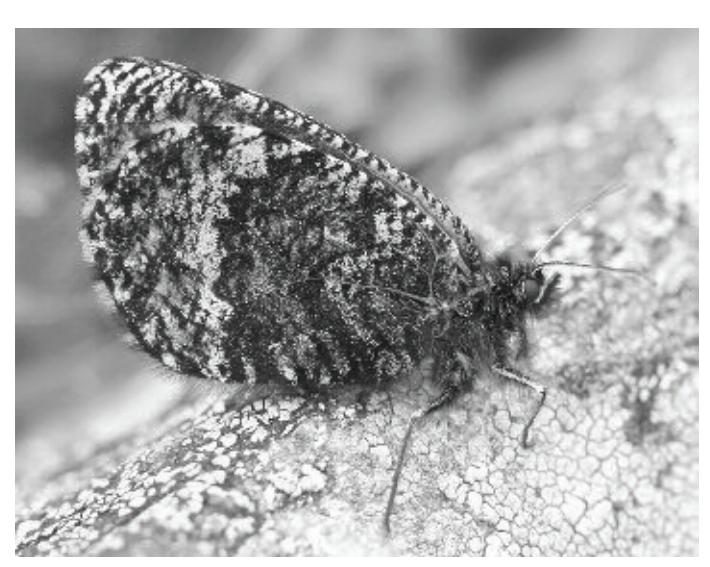
'White Mountain' Melissa Arctic ( Oeneis melissa ), 7/6/15, Mt. Washington, NH, Garry Kessler

Cover photo: Spring Azure ( Celastrina ladon ), lucia form, 4/22/15, Concord, MA, Bruce deGraaf