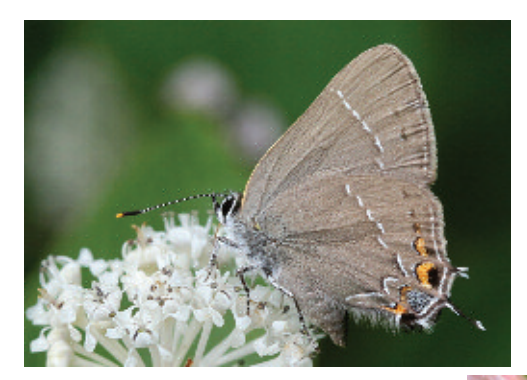
Oak Hairstreak ( Satyrium favonius ), 6/25/15, Middlesex Co., MA, Garry Kessler